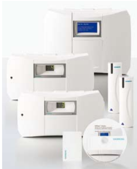
SiPass Entro starter kit