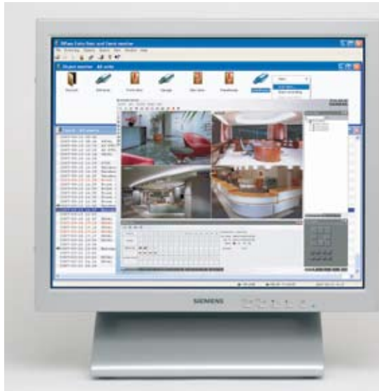
Video recordings are accessible directly from the SiPass Entro software