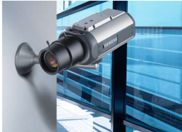
Video surveillance camera from Siemens